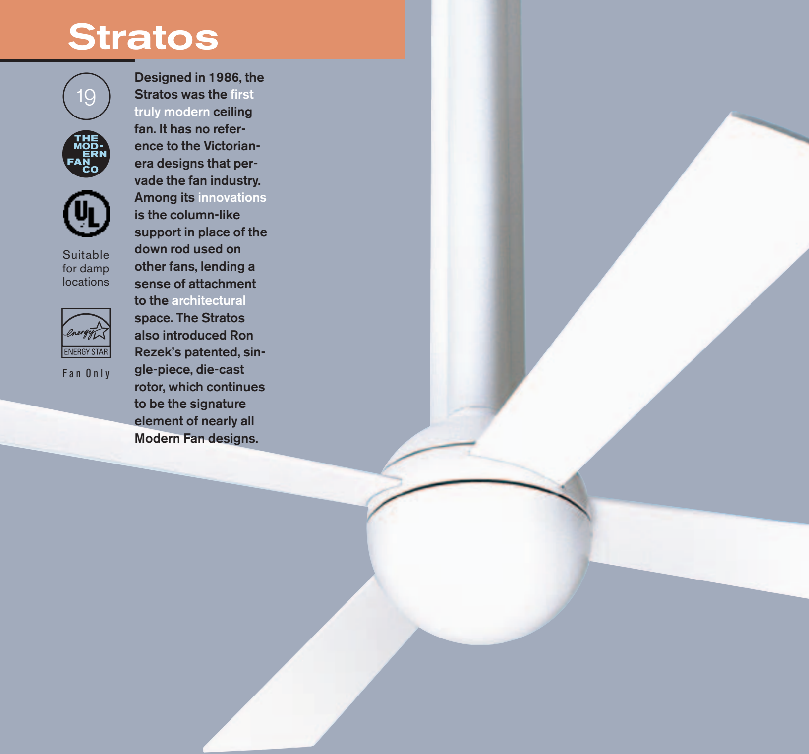
650 Light Kit (adds 1")