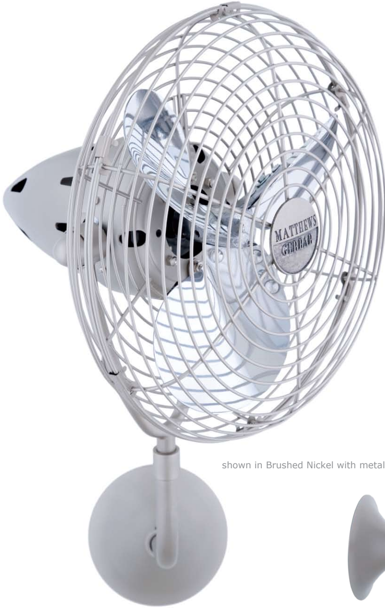
shown in Brushed Nickel with metal blades and decorative cage