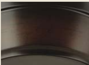
OBMA Oiled Bronze/ Mahogany