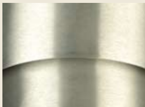
SS Stainless Steel