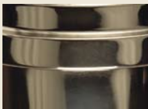
PLN Polished Nickel