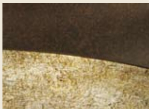
AGVM Aged Bronze/ Vintage Madera